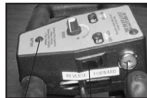
Normal Battery Gauge LED

Warning: While in Shabbat Mode the Amigo will not come to a complete stop when the throttle lever is released to the neutral position. In the event that you must stop the Amigo immediately you will need to depress the Emergency Brake Switch.